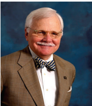
Greetings, Fellow Oslerians!