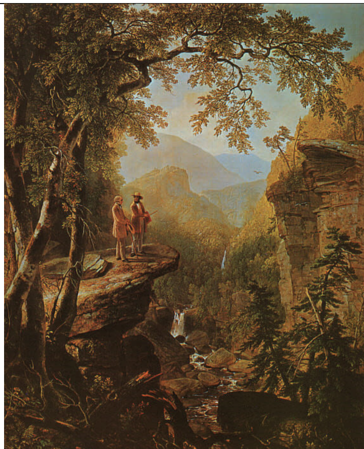
FIGURE 2 — Kindred Spirits